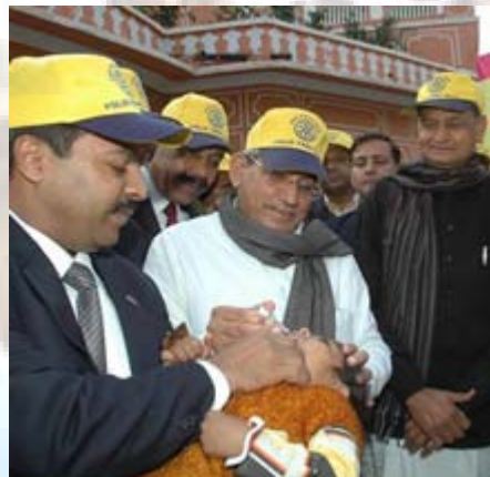
Rotarians and state government leaders in Jaipur, Rajasthan, India, vaccinate children against polio during a National Immunization Day in 2011.

Rotary club members worldwide are cautiously celebrating a major milestone in the global effort to eradicate polio. India, until recently an epicenter of the wild poliovirus, has gone one year without recording a new case of the crippling, sometimes fatal, disease.